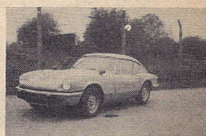
1971 TRIUMPH GT6 Mk III, overdrive, radio and h.r.w. Absolutely superb car in yellow with black trim..... £999

PART EXCHANGES WELCOME: HIGHEST POSSIBLE ALLOWANCES: "ON-THE-SPOT" H.P. AND INSURANCE