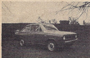
1974 DAF '66' SL coupe. Immaculate in tangerine with black trim. 'Variomatic' auto., h.r.w. One owner, 9,000 miles. £1,299