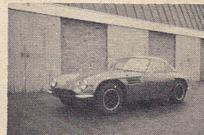
1970 TVR Vixen 1600. Sunroof, alloy wheels and radio. Nice example for the year, in metallic blue..... £1,049