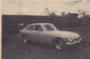
1974 M.G.-B V8 GT. Terrific performance within compact dimensions, overdrive, sunroof, tinted glass, h.r.w. £2,299