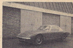
1973 LOTUS +2S 130/5. Beautiful in tawny with oatmeal trim. Sunroof, alloy wheels, 8-track stereo etc. .... £2,349