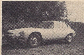
1973 JAGUAR 'E-Type' V12 2+2. One owner car in Regency red. Power steering, radio/stereo and h.r.w. .... £2,299