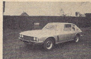
1971 JENSEN Interceptor Mk. II auto. PAS, radio/stereo, Sundym glass, electric windows, h.r.w. etc. Outstanding value at ..... £2,699