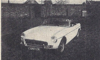
1973 MG-B roadster, with overdrive, radio and tonneau, attractive in beige £1,279