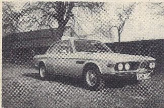
1973 'M' BMW 3.0 CSA, in silver with blue velour upholstery, automatic, power steering, electric windows, tinted glass, radio/stereo etc. Magnificent..... £4,899