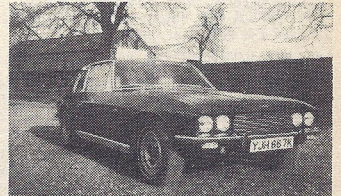
1971 JENSEN Mk. II automatic. Impressive in aubergine. Fitted with radio/stereo, Sundym, air-conditioning, alloy wheels etc..... £3,249

PART EXCHANGES WELCOME: HIGHEST POSSIBLE ALLOWANCES: "ON-THE-SPOT" H.P. AND INSURANCE