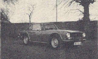
1974 TRIUMPH TR6 roadster, with overdrive, detachable hardtop and radio. Most attractive in bright red with black..... £1,749