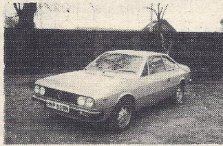
1975 LANCIA Beta 1600 coupe. Superior model, in yellow, alloy wheels, tinted screen, reclining seats and h.r.w..... £2,599