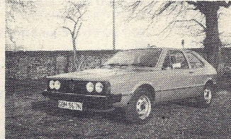
1975 (Series) VW Scirocco TS. 5,000 miles only, reel belts and h.r.w. Immaculate in red with check cloth trim... £2,299