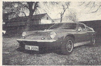
1974 LOTUS Europa Special. One private owner, 9,000 miles, 5-speed gearbox, alloy wheels, radio/cassette, tinted glass, Canadian green with oatmeal trim £2,899