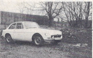
1973 (series) M.G.-B GT. Fitted with headrests and h.r.w. Attractive in white with navy velour seating..... £1,449