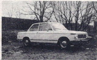
1973 BMW 2002 Tii. Terrific performance with saloon comfort; h.r.w. White with black trim..... £2,349