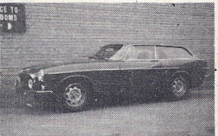
1972 VOLVO P.1800 ES sports estate. Smart car in red with black trim. Overdrive, h.r.w., etc..... £1,999

PART EXCHANGES WELCOME: HIGHEST POSSIBLE ALLOWANCES: "ON-THE-SPOT" H.P. AND INSURANCE