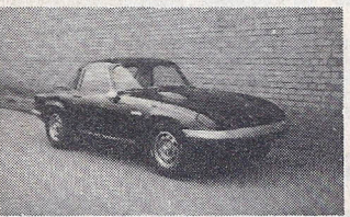
1971 LOTUS Elan Sprint fixed-head. Black with gold coachlining (J.P.S. colours). Extras include radio and h.r.w. Outstanding car..... £1,349

1971 VOLVO P.1800 E, P.I. engine. Overdrive, radio, h.r.w. One-owner car in red with black trim..... £1,599