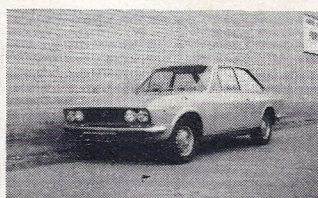
1972 FIAT 124 Sport coupe 1600, 5-speed gearbox, radio and h.r.w. Blue with tan interior..... £1,379