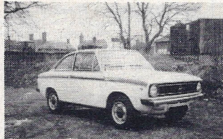
1973 DAF '66' Marathon coupe. One owner, 3,000 miles; h.r.w. Attractive fastback in white with black cloth trim £1,149