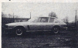
1971 JENSEN Interceptor Mk. II Automatic. P.A.S., Sundym, radio/stereo, h.r.w., etc. Silver with maroon hide..... £3,999

1971 ASTON MARTIN DBS V8. 5-speed, power steering, Sundym, radio/stereo, etc. Blue..... £4,499