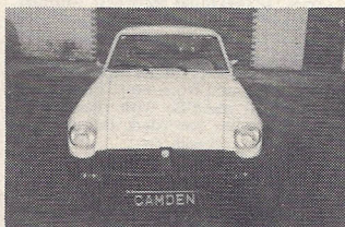
1974 M.G.-B roadster. Resplendent in citrus with navy seating. Overdrive, radio etc..... £1,599