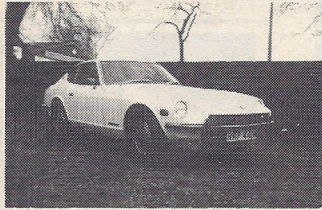
1974 DATSUN 260Z. Magnificent example in white, 5-speed gearbox, hi-back seating, h.r.w. etc..... £2,649