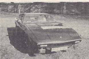
'P' Registered MASERATI Khamis. Nominal mileage only. Usual luxury specification including automatic gearbox, stereo radio/cassette etc. Metallic green with cream upholstery. Complete details and price upon application.