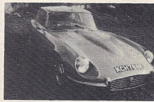
1972 JAGUAR +2 V12. Outstanding coupé with chrome wheels etc. Green with matching trim..... £2,699