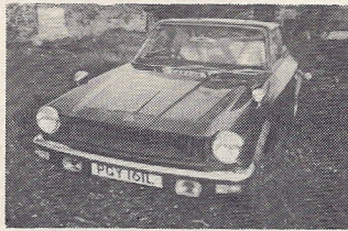
1973 GILBERN Invader Mk. III auto. Prestigious grand tourer in metallic jade with cream interior, Sundym, hi-back seats and h.r.w..... £1,899