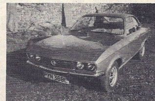
1973 OPEL Manta Berlinetta coupe, in gold with vinyl roof. Reclining seats, radio/8-track, h.r.w. etc..... £1,699