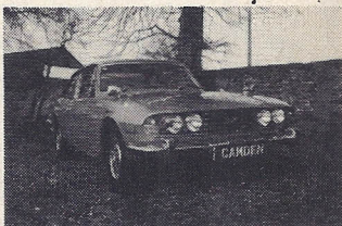
1973 TRIUMPH Stag auto. Hard/soft tops, electric windows, PAS, radio, Sundym, reclining seats, h.r.w. etc. etc. £2,649

PART EXCHANGES WELCOME: HIGHEST POSSIBLE ALLOWANCES: "ON-THE-SPOT" H.P. AND INSURANCE