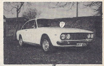
1975 LANCIA 2000 coupe. Imperious sportster with power steering, reclining seats and h.r.w..... £2,799