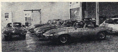
JAGUAR E-TYPE — ALL YEARS.

1969 LOTUS Europa S2. Latest model finished in royal blue with black interior. Available now... £1,599 1965 LOTUS Seven. Special modified sports giving outstanding performance. British Racing Green £599 1965 M.G. Midget. Very clean example, in red with black trim. Includes wire wheels and radio..... £429 1966 M.G. Midget. Special wide rim wheels and improved suspension. Excel. performance; in B.R.G. £479 'F' Regd. M.G. Midget. April yellow with black int. 'Colonel Bogey' air horns, wire wheels..... £629 1960 M.G.-A. Rare example in this condition. Finished in royal blue. Very well kept, excel. mechanically £329 1963 M.G.-B roadster. Really good early example, in white with red trim, with radio and overdrive... £479 1964 M.G.-B roadster. Bought because of its outstanding cond. Mineral blue. O/drive, wire wheels £549 1965 M.G.-B roadster. Many extras incl. wire wheels, overdrive, folding hood, radio, in red..... £599 1966 M.G.-B roadster. One owner from new. Overdrive, w/w., leather rim s/wheel, air horns..... £649 1967 M.G.-B roadster. Another except. example, this one finished mineral blue, w/w., low mileage £799 1968 M.G.-B roadster. Absolutely standard car in 'as new' cond. Has overdrive and new tonneau..... £849 1966 M.G.-B GT. Duo-tone black and green. Special wheels, overdrive and radio..... £849 1967 M.G.-B GT. Tartan red with black interior. Chrome wire wheels and overdrive. One owner £899