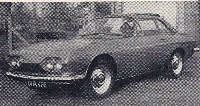
1967 RELIANT 3-litre Scimitar, Manhattan blue/black, Webasto sun-roof, overdrive, radio, tape player, Cints.; one owner. .... £965