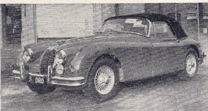
1958 XK150 d.h.c., red/red, overdrive, wire wheels; original log book showing history of owners, recorded mileage 59,968; recent hood; one of the better ones on offer at a realistic figure of. .... £645