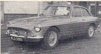
1969 M.G.-C GT, silver grey/black, chrome wire wheels, h.r.w., sun-roof, overdrive, radio, heater, ice alert; £220 Downton conversion Nov. '70; one owner. .... £1,165