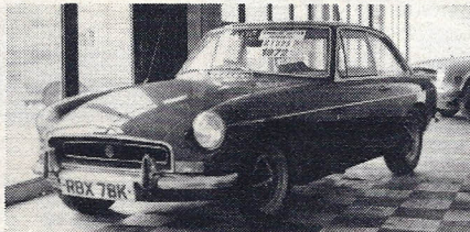
1972 M.G.-B GT Automatic, ..... £1,325

1973 MGB , black, overdrive, chrome rostyles, tonneau, cinturato's (spare unused), radio, leather wheel, head