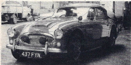
1967 AUSTIN HEALEY 3000 ..... £1,145

1967 AUSTIN HEALEY 3000 CONVERTIBLE , red/black, wire wheels, radio, fog/spot, 3 owners last one airline pilot, new exhaust system throughout ..... £1,145