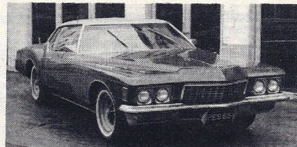
1972 BUICK RIVIERA G.S. .... £2,795

1971 M.G. Midget , blaze, two owners, confirmed mileage ..... £575