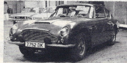
1967 ASTON MARTIN DB6 ..... £1,745

We are 1 1/2 miles west from Chiswick Roundabout. Opening hours MON. to SAT. 9 a.m. to 7 p.m. (Works) 8 a.m. to 6 p.m. For Sunday (viewing only), Telephone Saturday for an appointment. Courtesy car : Proceed Piccadilly Line to South Ealing, cross road to W. H. Cocks & Sons who will arrange transport to Performance Cars Ltd. If Cocks are closed, use public phone outside tube station.