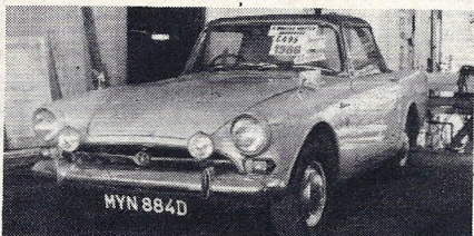
1966 SUNBEAM ALPINE Mk.V ..... £495

rests, servo, lighter, one owner, certified mileage 4,214 ..... £1,265