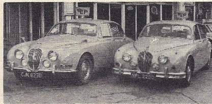
1966 JAGUAR 3.4 'S'-type automatic, light grey, one owner, PAS, radio, h.r.w. ( Illus. )..... £745