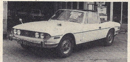
1971 TRIUMPH Stag, white/red, automatic, power steering, electric windows ( Illus. )..... £1,545