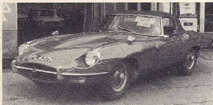
1970 JAGUAR 'E'-type roadster, tobacco leaf, chrome wire wheels, SP sports, radio ( Illus. )... £1,945