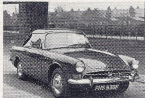
1968 ALPINE Mk. V GT, holly green/black, servo, overdrive; one owner ..... £745