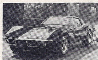
New unregistered 1971 STINGRAY £4,100 (list £5,100)

1969 (Oct.) AUSTIN 3-litre saloon, brown/beige, o/d., P.A.S., reclining seats; one owner ..... £895