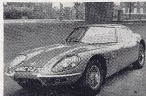
1969 MARCOS 1600, orange/black, sun-roof, wire wheels, radio; recorded mileage 17,907 ..... £1,195

(A4, 1½ miles west from Chiswick roundabout.)