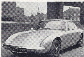
1968 ELAN 2+2, silver grey, servo discs, G800s; recorded mileage 31,014 ..... £1,195